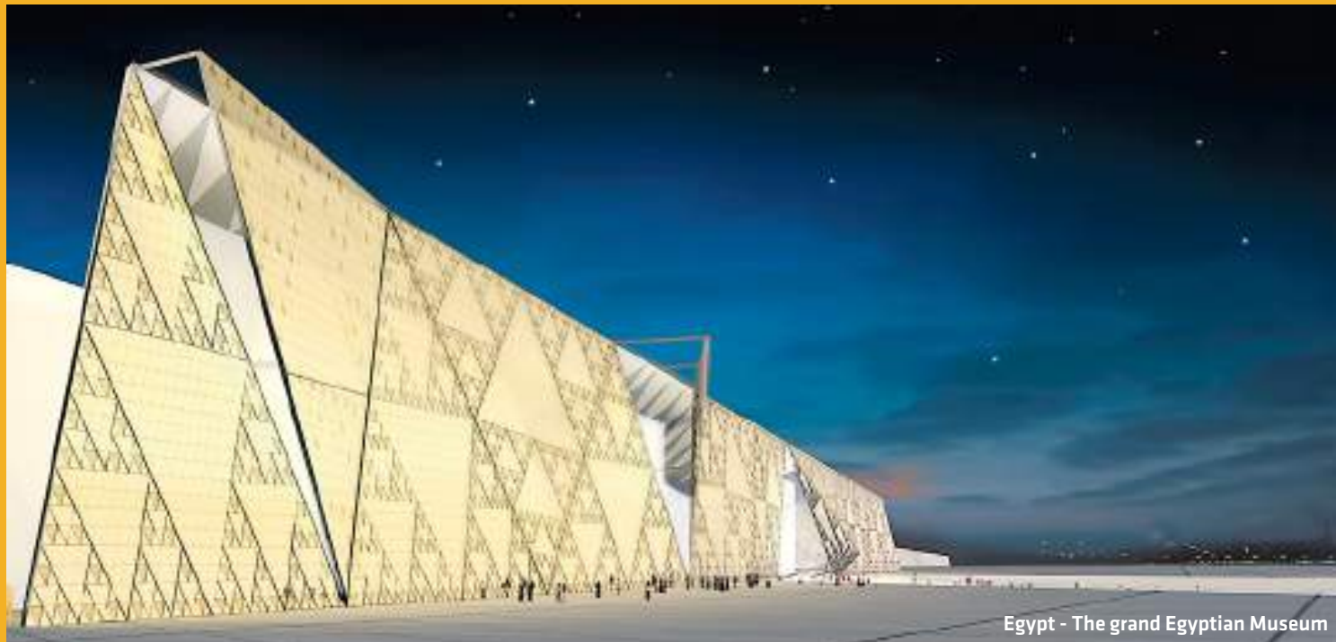
Egypt - The grand Egyptian Museum