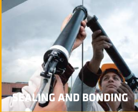
SEALING AND BONDING